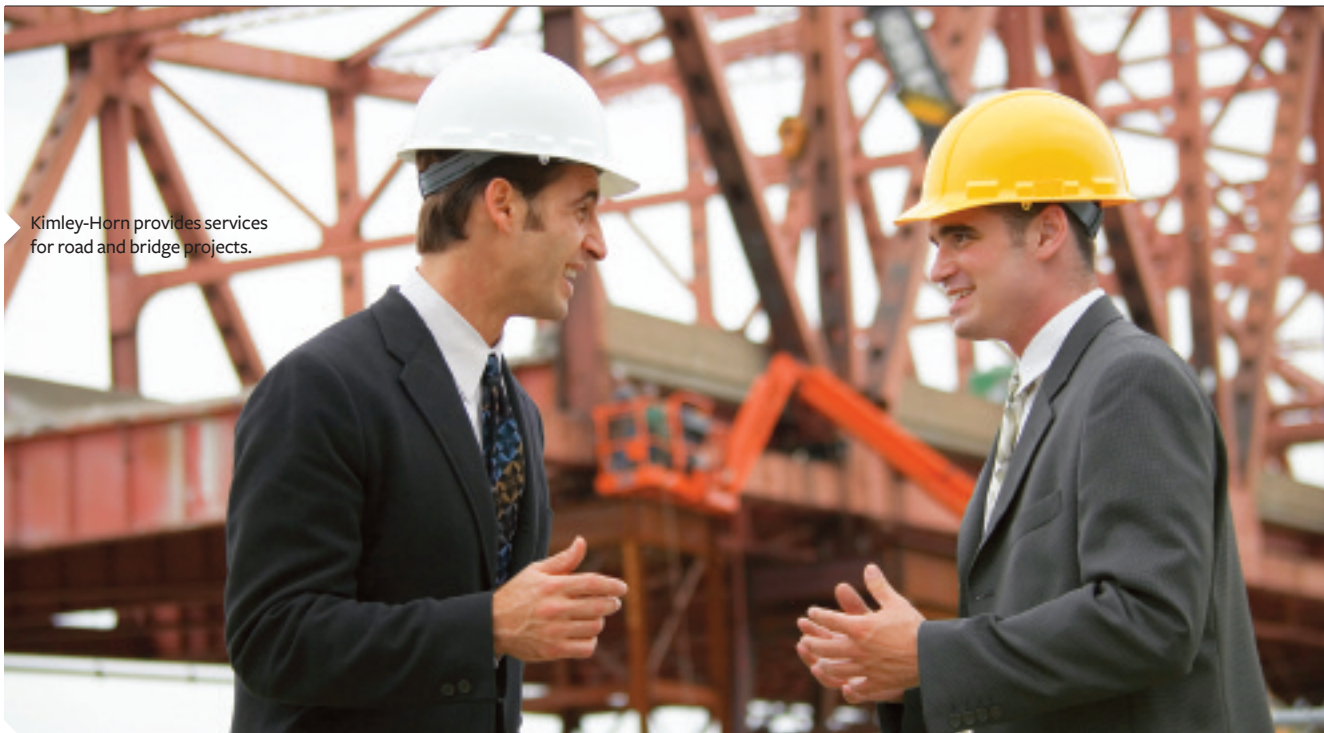
Kimley-Horn provides services for road and bridge projects.